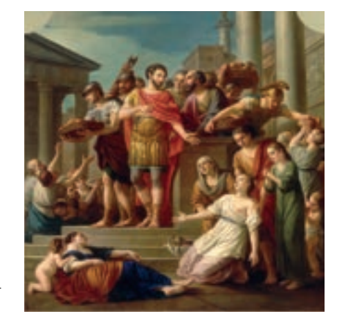
3 Painting by Joseph Marie Vien, Marc Aurèle secourant le peuple, 1765

For centuries, Marcus Aurelius and his "Meditations" have attracted interest not only from rulers, but also from political philosphers, moral philosophers and artists. Based on this reception history, the Stadtmuseum Simeonstift displays high quality exhibits to encapsulate how artistic representations of "good governance" have changed over the course of history: When is a period of rule considered good and just? The paintings, sculptures, caricatures and media from eight centuries of art history shed light on this question, as a fascinating constant of human history with considerable topicality.